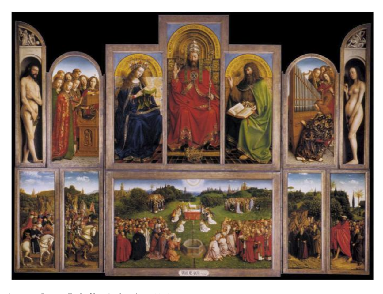
Illustration no. 4. Jan van Eyck, Ghent's Alterpiece (1432)