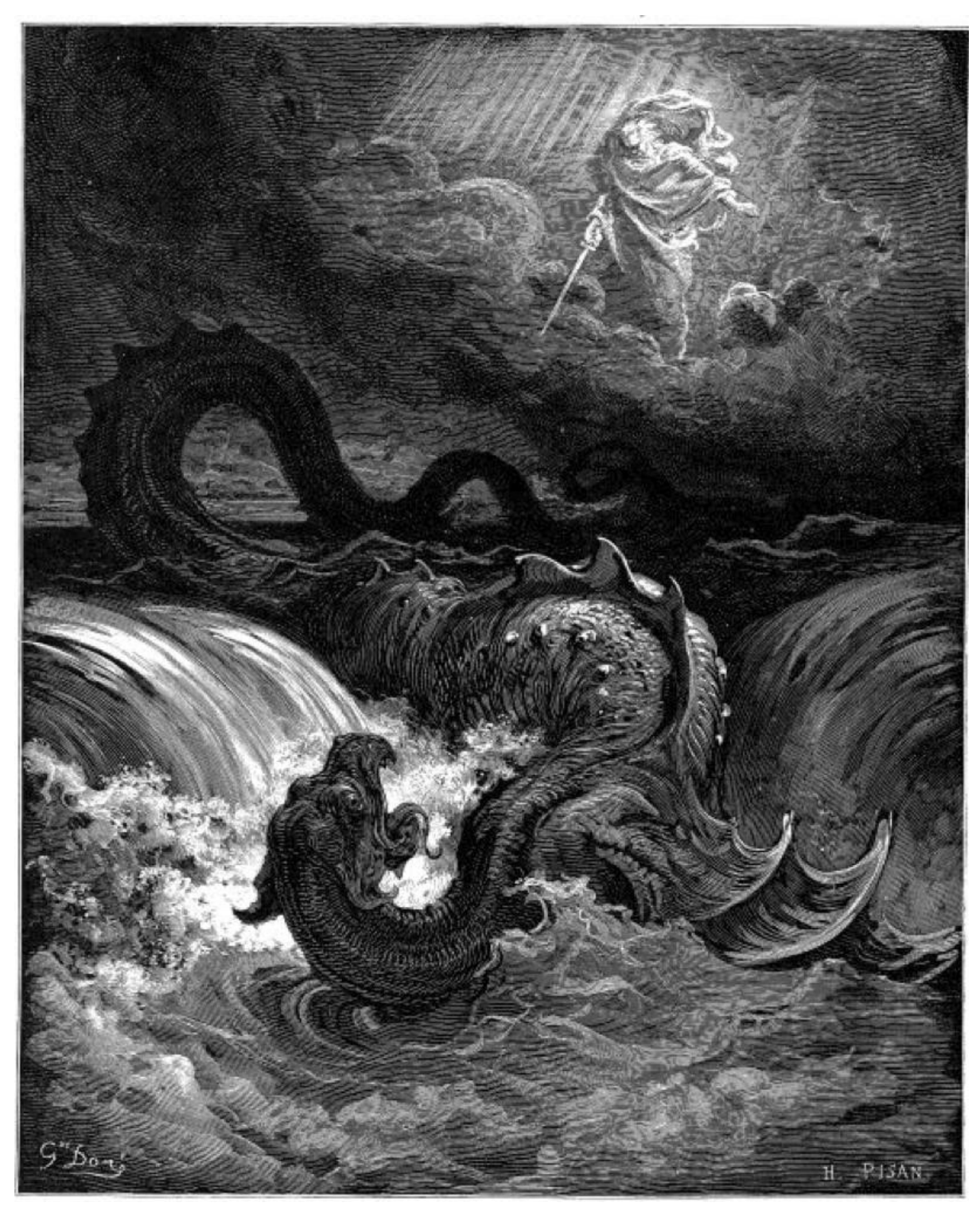
Illustration no. 3. Gustave Doré, Destruction de Léviathan (1865)