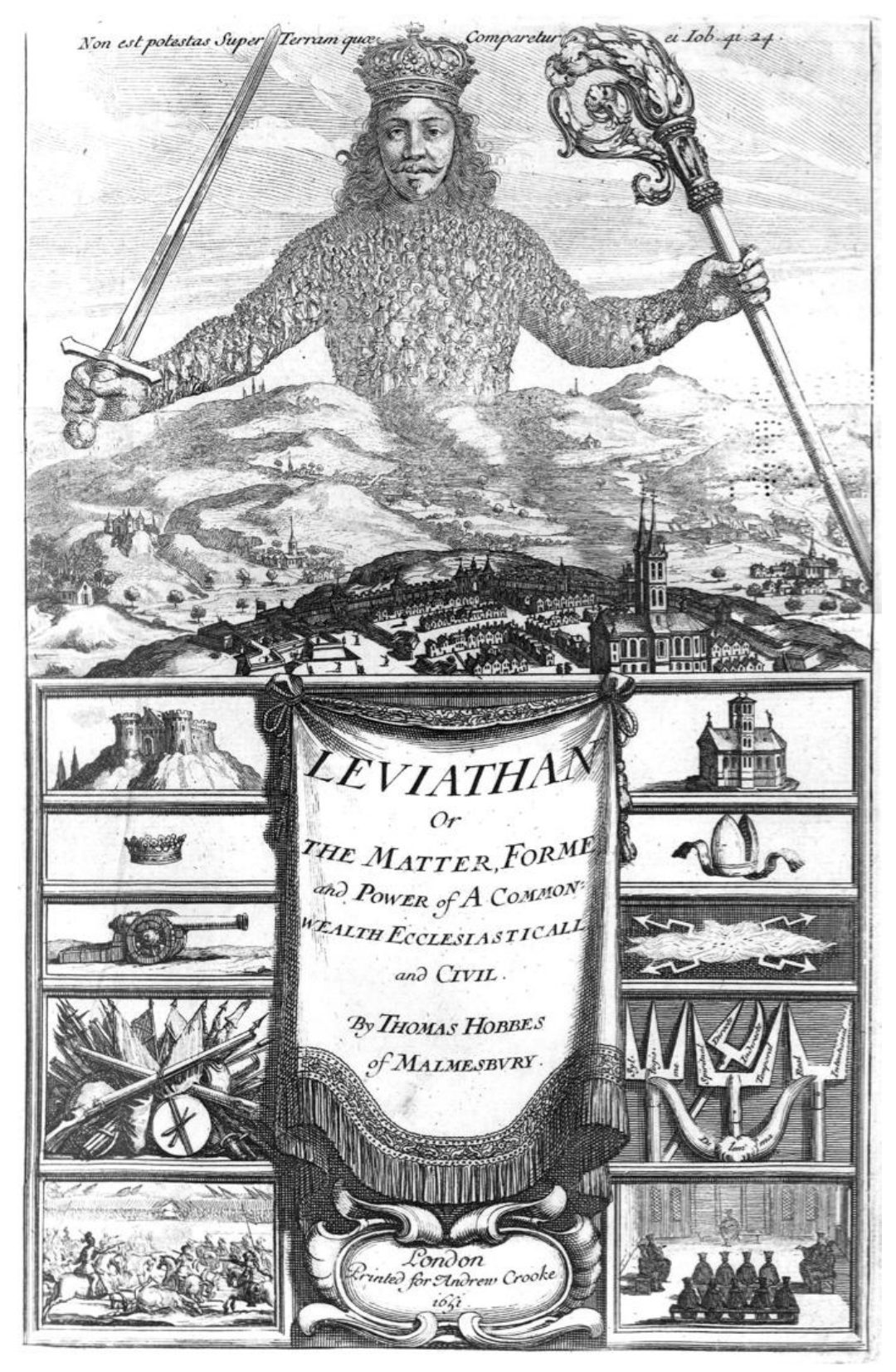
Illustration no. 1. Frontispiece, Thomas Hobbes' Leviathan, Abraham Bosse (1651)